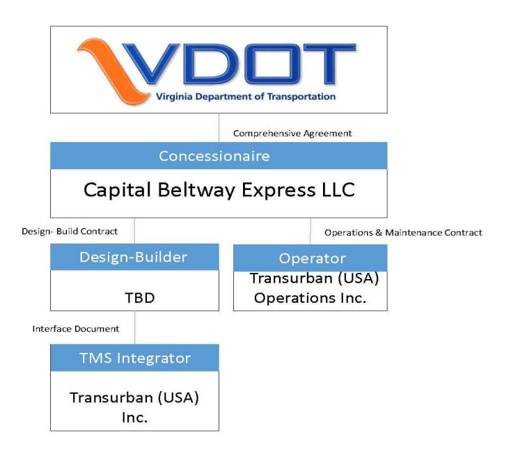
Figure 2. Project Contracting Structure

Figure 2 provides an overview of Project NEXT delivery structure and contracting relationships. The proposed project structure will require a collaborative approach between the Design-Builder and Traffic Management System (TMS) Subcontractor to ensure successful and timely delivery of the project.