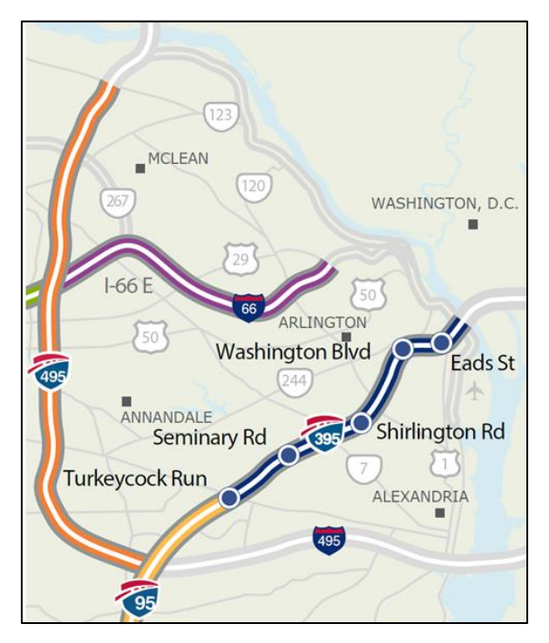
Figure 1. 395 Express Lanes Project Corridor

The 395 Express Lanes project is an extension of the existing 95 Express Lanes that will convert the two existing reversible HOV (High Occupancy Vehicle) Lanes located in the I-395 median to three HOT (High Occupancy Toll) Lanes (Express Lanes). The project corridor extends approximately eight miles from the current northern terminus of the 95 Express Lanes at Turkeycock Run in Fairfax County (south of Route 236) through the City of Alexandria and Arlington County to the 14<sup>th</sup> Street Bridge; refer to Figure 1. The northern section of the project corridor from south of Eads Street near the Pentagon to the District of Columbia (DC) is a fourlane divided expressway (2-lanes in each direction). Some project components will be located in DC, on arterial roadways and on the Pentagon reservation. Upon completion, the 395 Express Lanes will be subject to the same rules and regulations as the existing 95 Express Lanes, and the two will be operated by the Concessionaire as a single, fully integrated Express Lanes facility under the terms of its concession agreement with Virginia Department of Transportation (VDOT).